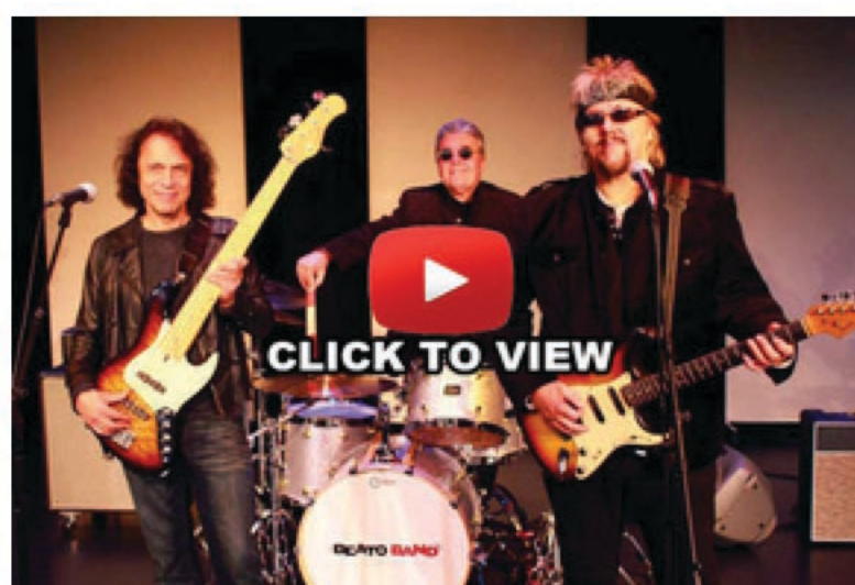
MY OLD FRIEND VIDEO