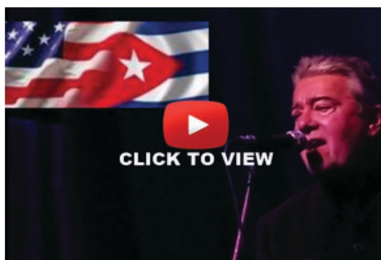
CUBA BC PREVIEW VIDEO